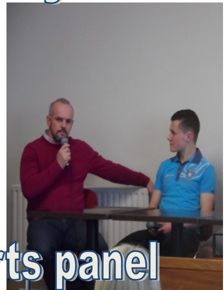
curry night & sports panel