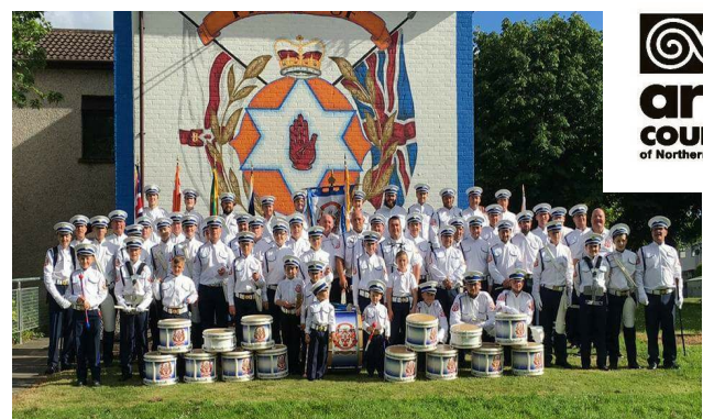
Pride Of Ballybeen Flute Band Competition Fri 4th May 7-10.30 pm . Starts at Ballyoran Centre